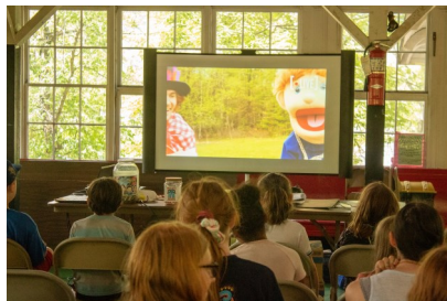
“Sweep and Isaac Live”