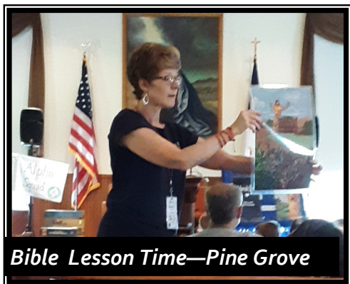
Bible Lesson Time—Pine Grove