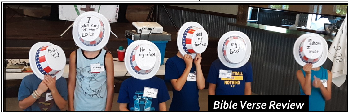
Bible Verse Review

"Thank you for making my daughters excited to learn about God!"